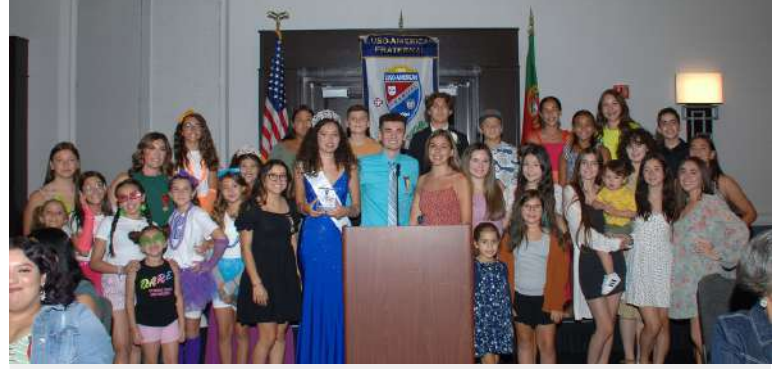
Youth Council #2 - San Jose