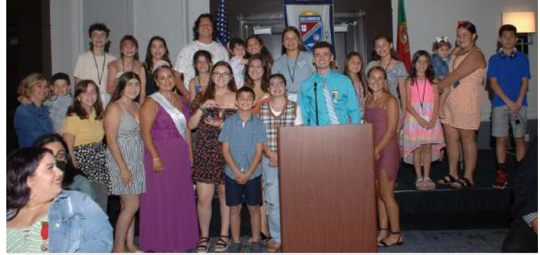
Youth Council #1 - Fremont/Union City