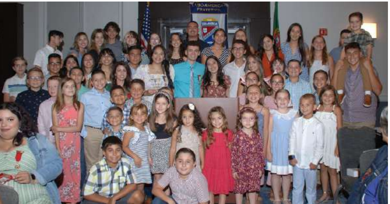
Youth Council #24 - Northern San Joaquin Valley