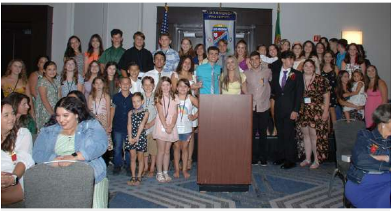
Youth Council #4 - Sacramento